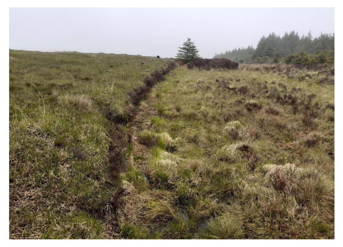
Plate 4. View of edge of bog – Plan will involve removal of self-seeded conifers and, where required, blocking of drains. June 2021.