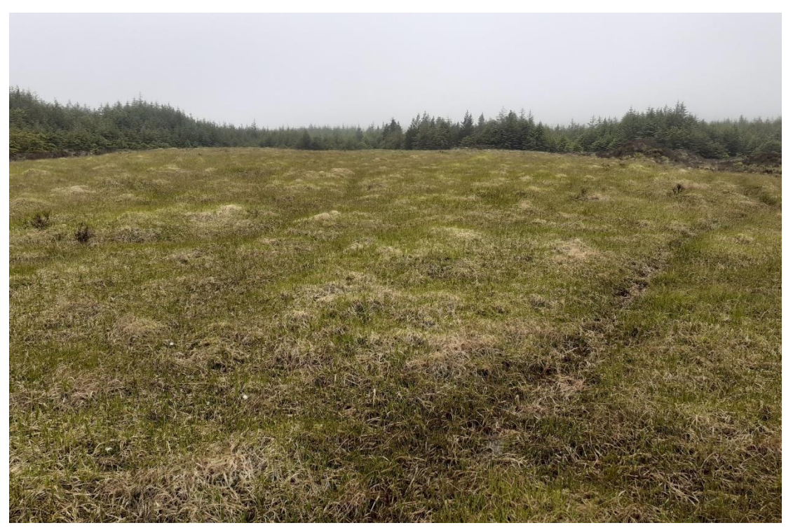
Plate 3. View of area of uncut blanket bog in western sector of Plan area. This was probably burnt in the past as shown by relatively uniform vegetation. June 2021.