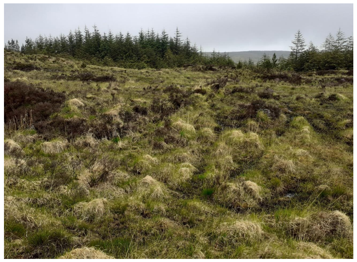
Plate 2. View of unplanted area dominated by heath vegetation. June 2021.