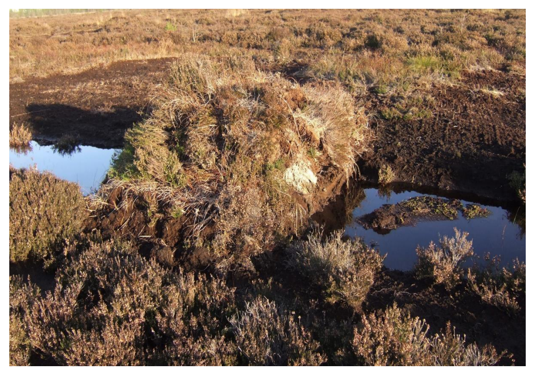
Plate 5. Example of use of a 'peat plug' in drain blocking – the plugs are placed at intervals along the drain and are highly effective in stemming water loss from the bog.

After tree clearance, an inspection will be made to assess if the forest drains require blocking. Emphasis will be on drains with flowing water. Blocking will be by dam construction using a suitable medium, such as a peat plug (see Plate 5) or plastic sheet piling (see Mackin et al. 2017).