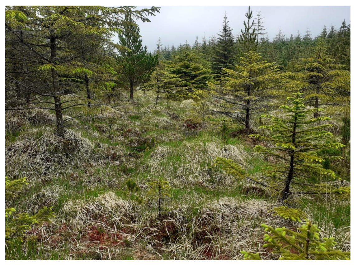
Plate 1. View of poorly grown conifers – note presence of bog vegetation, including Sphagnum moss in places (as shown in bottom left of photo). June 2021.